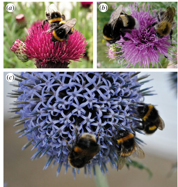
Figure 3. Multiple pollinators, of the same and different species, are often observed feeding together on inflorescences with many nectaries potentially leading to bees acquiring the social pre-foraging experience which facilitates joining behaviour in dangerous environments. (a) Bombus terrestris (or lucorum ) foragers feed from an ornamental thistle ( Cirsium rivulare ). (b) B. terrestris (or lucorum ) and B. pascuorum individuals collect resources from a creeping thistle flower ( Cirsium arvense ). (c) B. terrestris (or lucorum ) feed together on a globe thistle ( Echinops ritro ). (Online version in colour.)

The behavioural strategy we observe here is consistent with existing social learning theory which predicts that social information should only be used in specific fitness enhancing circumstances [38–40]. When information is not costly to acquire (such as landing at a flower where there is no predation risk), it is more beneficial to use personal information than to follow conspecifics. This is because, typically, more food resources are acquired by feeding alone than sharing the resource with multiple individuals. Conversely, when information acquisition imposes a high risk, such as feeding on a flower potentially harbouring predators, it is more beneficial to use social rather than to use personal information, even if this carries a significant cost in food intake. For example, previous research demonstrates that bumblebees that encounter flowers with which they are already familiar, avoid flowers occupied by conspecifics, yet conversely seek out conspecifics when foraging from unfamiliar flower types, most likely in response to the costs involved with personal exploration, such as trial-and-error sampling [41,42]. However, we should be cautious in placing our findings in a similar